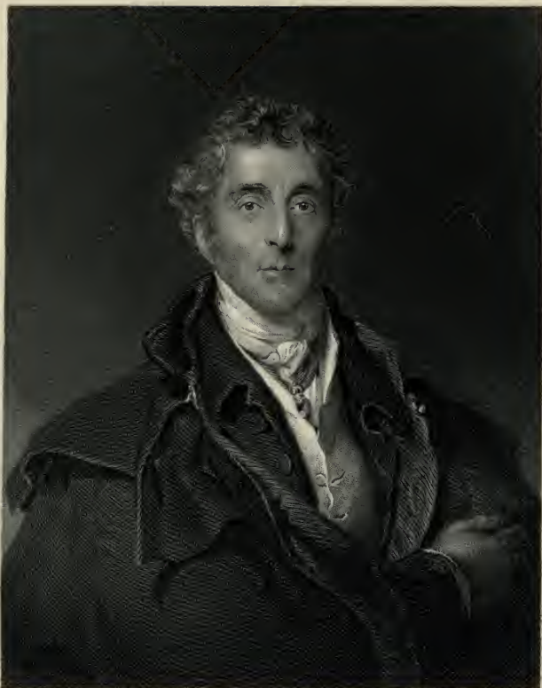
Sir Tho s . Lawrence, P.R.A.